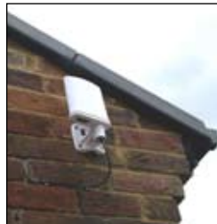
The kind of aerial typically mounted on your home or office.

Village Networks provides everything required to connect you. On the outside of your premises, a small aerial receives and transmits your broadband signal. The aerial has a cable to the inside of your property, where it's connected directly to a router, and then to your network. Power to the aerial is provided from a small power supply connected to a wall socket, then through the same cable that carries the data.