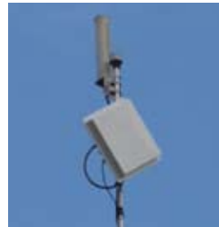
A typical Village Networks node aerial, which distributes the broadband connection to several locations.